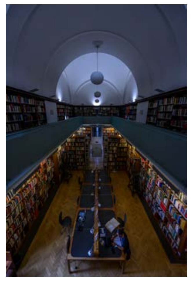
BSR Library, November 2023