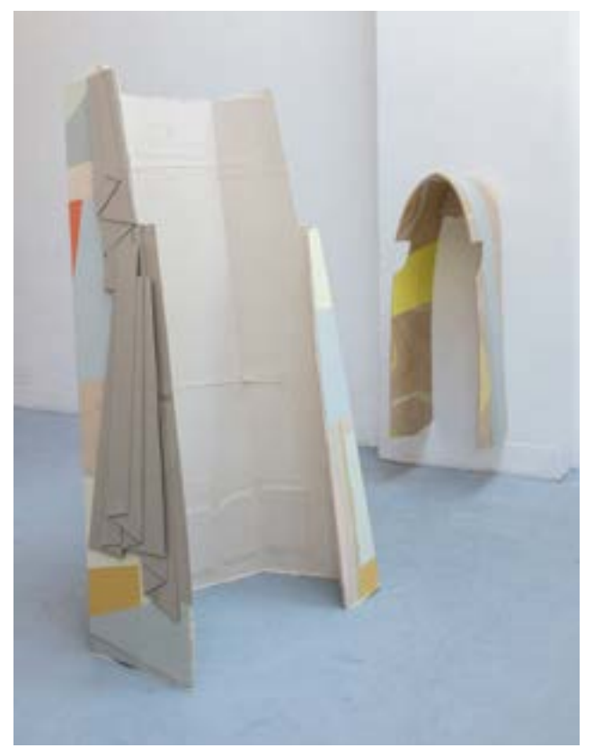
Lynn Fulton's Studio, Spring Open Studios, March 2024, photo by Luana Rigolli