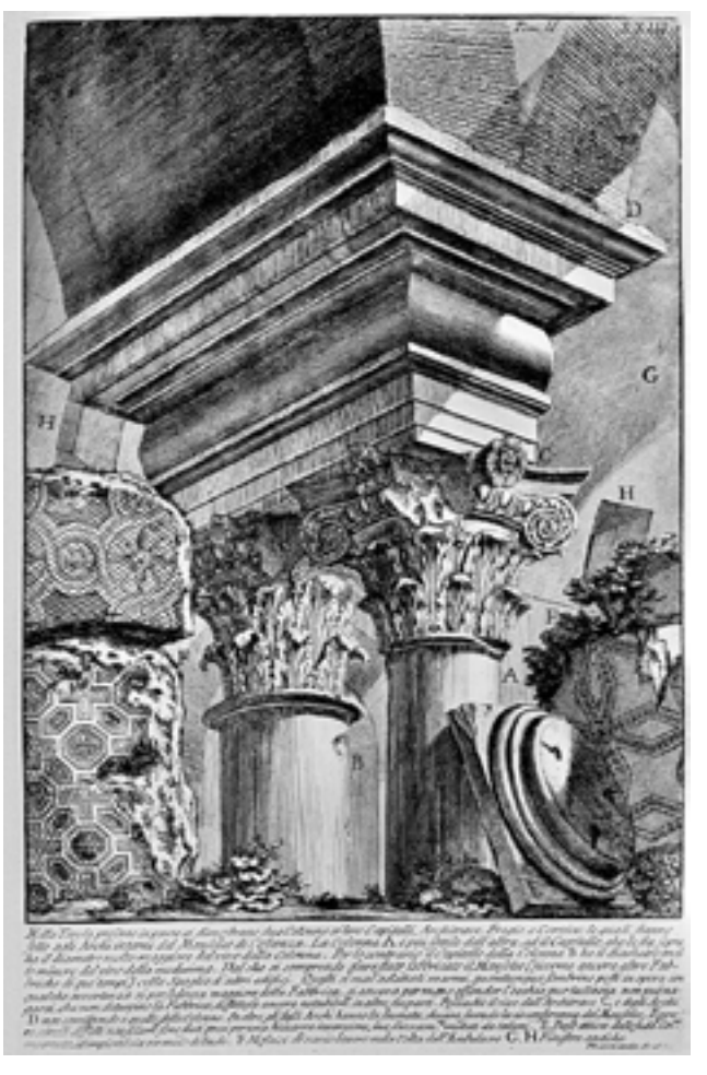
G.B. Piranesi, Interno dell'Mausoleo di Costanza, from Antichità Romane vol. II, BSR collection

18:00 - 20:30 Photographic exhibition by Antonio Palmieri. The exhibition will be open until 15 July, from Monday to Friday, 2 - 7 pm